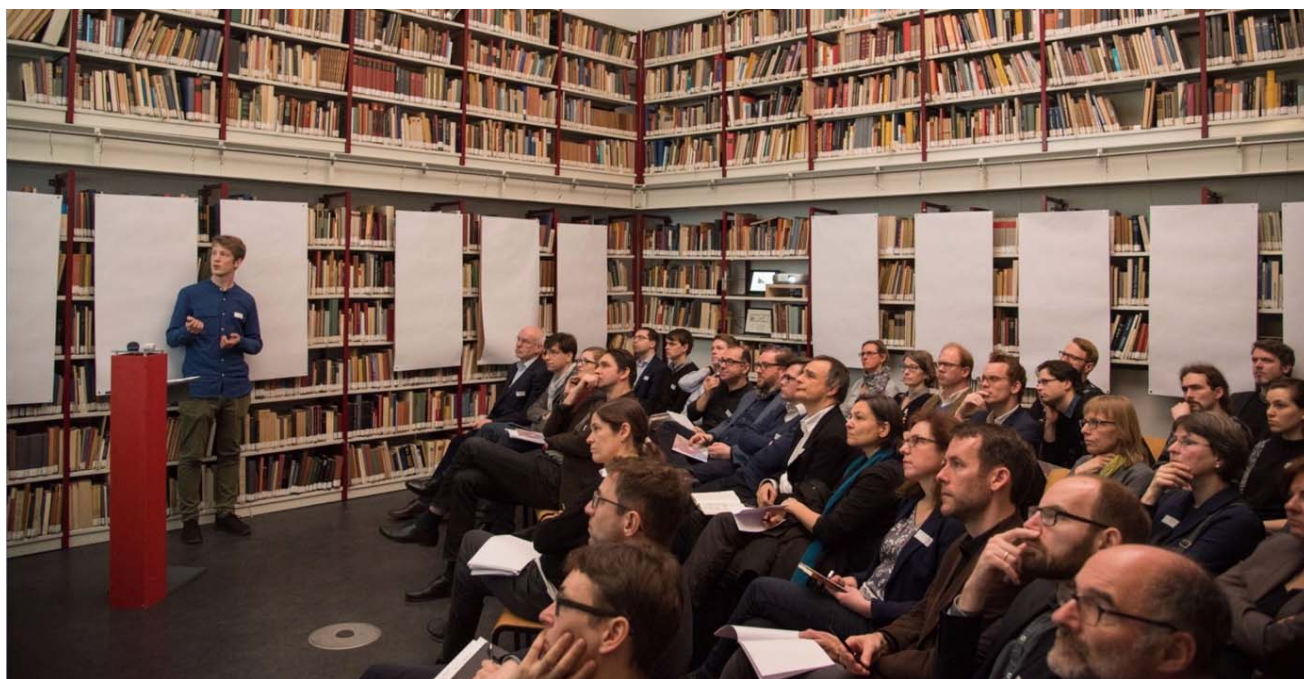
Fig. 1: Baureka's initial workshop in Aachen, March 2017.

tackle new, comparative research questions. And finally, they would create a completely new basis for cooperation and exchange within and beyond the community, for example by tapping into synergies between research, conservation and planning. Baureka.online has thus been conceived as a comprehensive web-based platform that will become a crucial prerequisite of a new culture of data exchange and publishing within the discipline and community of building archaeology.