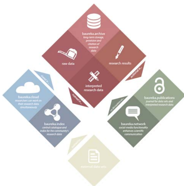
Fig. 2: Internal structure of baureka.online

Further talks with the research community were then undertaken in a day-long workshop in March 2017 (Fig. 1). On this occasion, together with approximately 40 participants the authors were able to verify the feasibility of the project, identify its possible pitfalls and collect additional opinions on the direction it would have to take. In addition, a steering committee was created which as soon as the authors' funding requests prove successful, will meet about once every six months to accompany and evaluate the development of the project. During the discussions it became clear that in addition to the original use cases, i.e. archiving, exchanging and publishing research data, there was also a rising demand for further tools aimed at improving communication within the discipline and at structuring collaborative workflows. At the same time, however, the participants reached the conclusion that in order to establish the platform as a central contact point for retrieving building research data it was essential to arrive at an